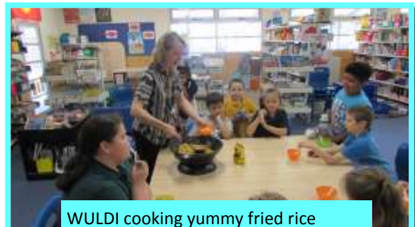
WULDI cooking yummy fried rice